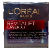
LASER X3 NOCHE 18601-301