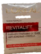
OJOS RNV 18601-401