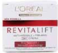
REVITALIF DIA 18601-13