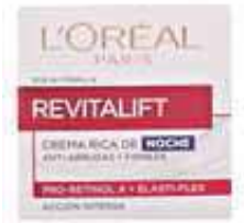
REVITALIF NOCHE 18601-14