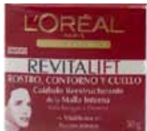
ROSTRO, CONTORNO Y CUELLO 18601-27