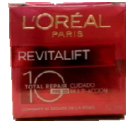
TOTAL REPAIR 10 18601-25