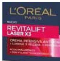
LASER DIA RNV 18601-29